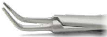
ZFC073 # 2 Curva - Curved