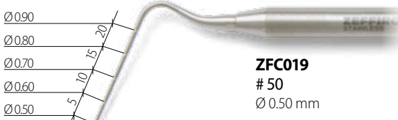
ZFC019 # 50 Ø 0.50 mm