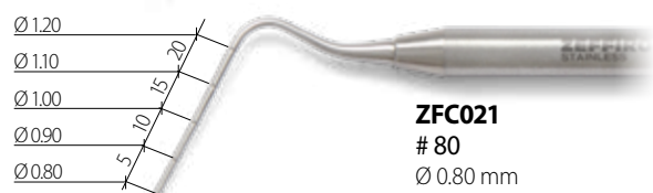
ZFC021 # 80 Ø 0.80 mm