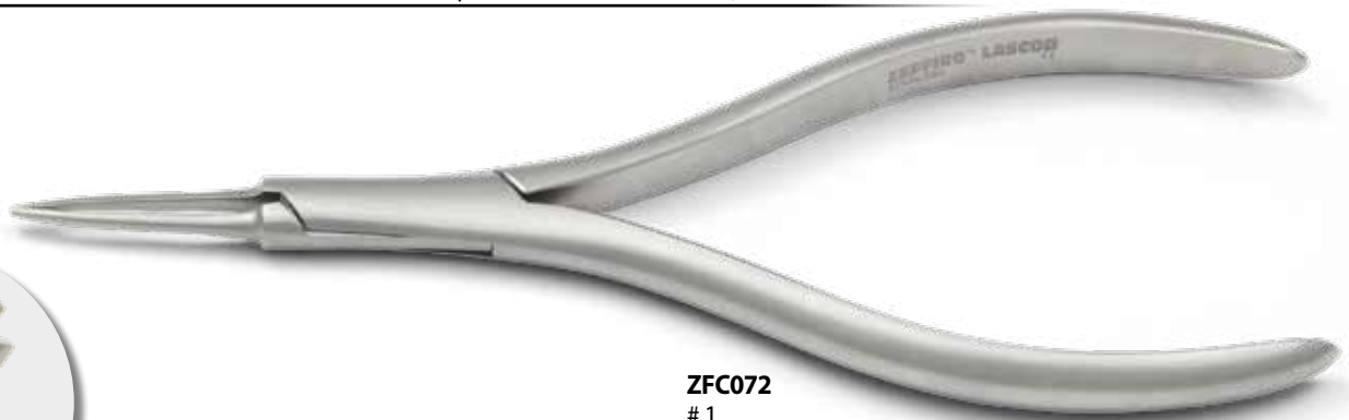
ZFC072 # 1 Retta - Straight