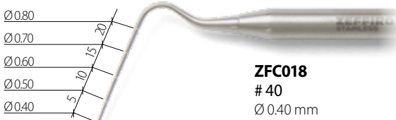
ZFC018 # 40 Ø 0.40 mm