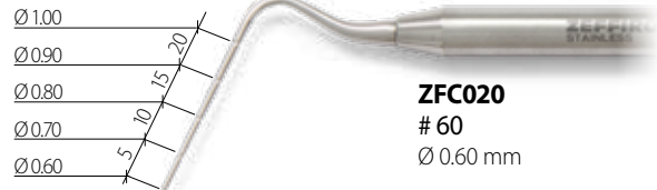
ZFC020 # 60 Ø 0.60 mm