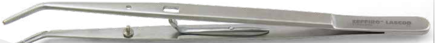
ZFR020 # EP1