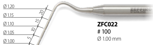
ZFC022 # 100 Ø 1.00 mm